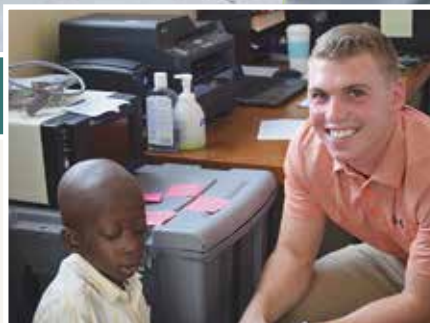
With Kirk — A day at the office