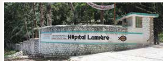
Hospital Lumiere, Bonne Fin, Haiti

2016 was the 2nd year that HarvestCall eye clinics were conducted at Hospital Lumiere.