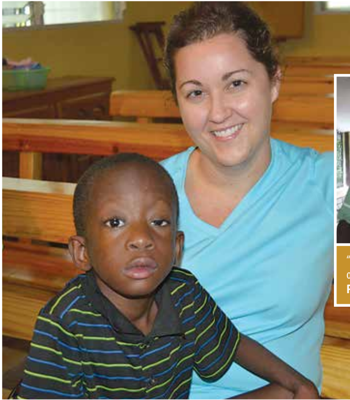
Happy to be held by visitors