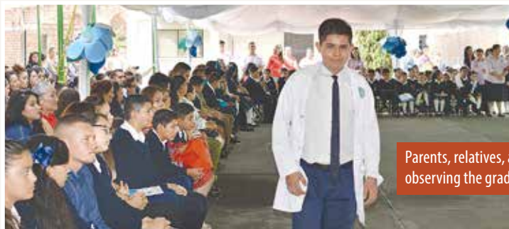
Parents, relatives, and students observing the graduation ceremony

During the ceremony, the children were encouraged through Philippians 4:8 to think on and do whatsoever things are true (verdadero), honest