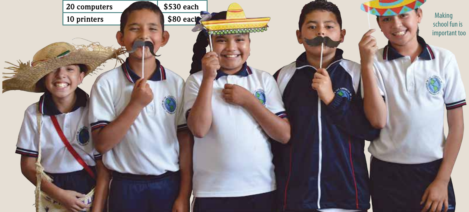
Making school fun is important too