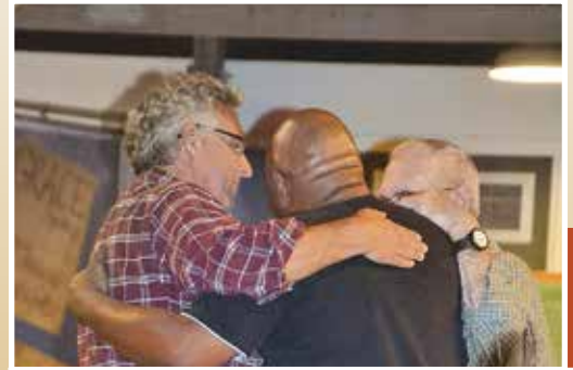
A return to SC allows us to build on existing relationships

So while the Bible does not prescribe a specific method for financially supporting missionaries, we believe the Servant Fund is a viable biblical model that aligns well with scriptural principles regarding our obligation to support those serving on behalf of the gospel in a collective manner, as the body of Christ.