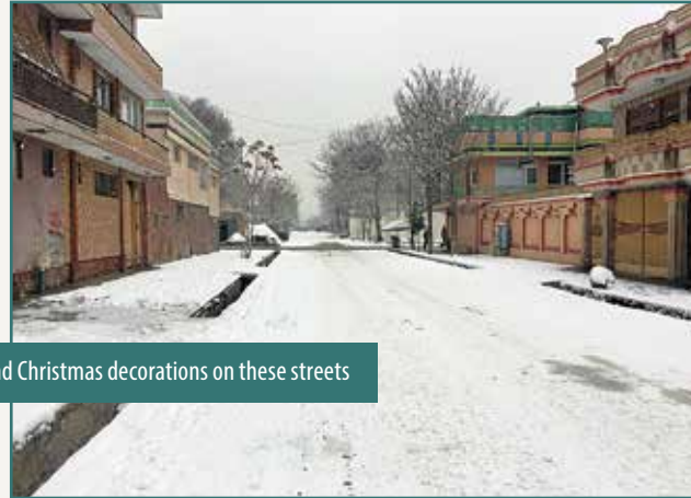
You won't find Christmas decorations on these streets

“Christmas was different this year--my first Christmas in a Muslim country. All the believers in our town gathered, and we sat cross-legged on floor mats around the perimeter of the sitting room in our friend’s house, stoking the woodstove and drinking hot tea. We read the Christmas story, sang Christmas carols, and ate what Christmas food we could make with the ingredients available. But the strangest thing to me was knowing that we few were the church in that place. For everyone else in our city it was just another workday. No Christmas. No Jesus.” ~a sister, name withheld for security reasons