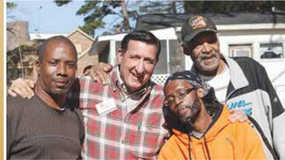
We will again build new homes, but also fix up many that are in disrepair