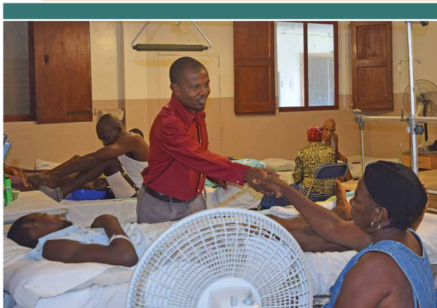
Making the rounds in the wards – showing compassion and Christian love

And he said unto them, Go ye into all the world, and preach the gospel to every creature. Mark 16:15