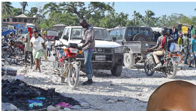
Haiti's busy roads are hazardous for pedestrians.