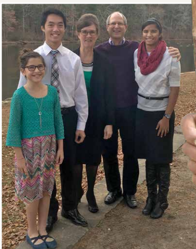
Back in Ohio – the time in Haiti opened our eyes and hearts.

When God called us to serve as it pleased Him in Haiti, the "heart signs" were sure. Being a foreign missionary is a very public manifestation of service. However, weren't we missionaries before Haiti? Weren't we just like our