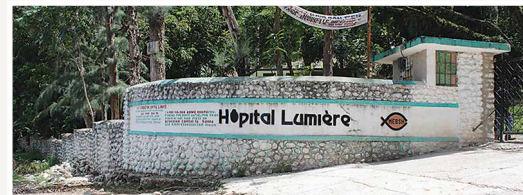
Hospital Lumiere, Bonne Fin, Haiti

Through the grace and blessing of God, Hospital Lumiere shines as a beacon of hope and healing to the people of Haiti. HarvestCall is thankful to see continuing evidence of God's work at the hospital.