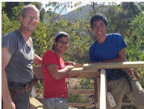
Missionary Service – Wherever, Whenever, Whatever!

The lesson He is teaching us may be that missionary service is this: to serve the Lord wherever, whenever, and whatever!