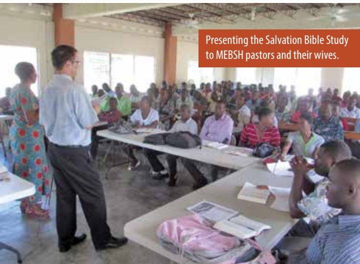
Presenting the Salvation Bible Study to MEBSh pastors and their wives.

study Jesus Christ, the books of John and Mark, and the importance of prayer, reading God's Word, and growth through the Holy Spirit. The older students will study the New Testament from Acts through II Timothy. In addition, Grade 8 students will study the ACCA Salvation Bible Study.