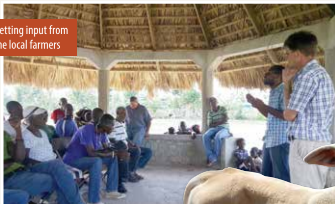
Getting input from the local farmers