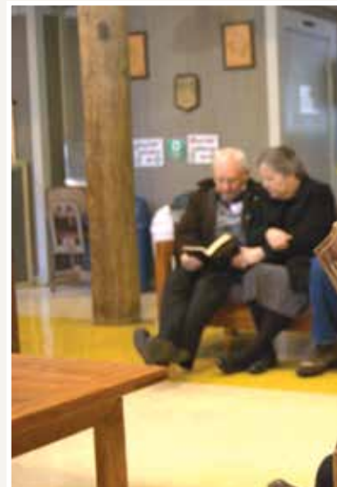
Studying the Word together

For those of us who have experienced this and are His children, someone shared the gospel message with us. Jesus now invites us to "come follow him and he will make us fishers of men." To do this, we each need to know and love the gospel.