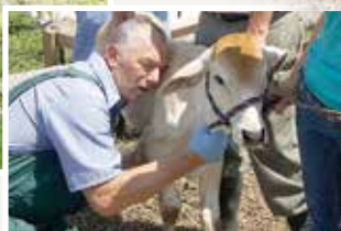
Examination of new calf, Ivory