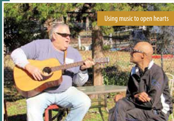
Using music to open hearts

explains it as the good news of how we can be reconciled to God by grace through faith in Jesus and be transformed in heart and mind by the power of the Holy Spirit.