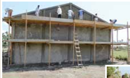
Nearing completion on shop-depot