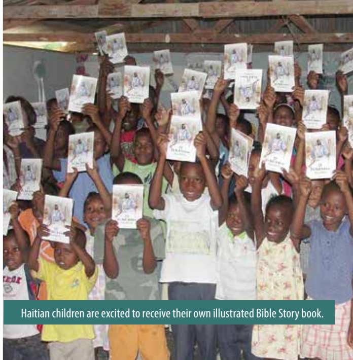
Haitian children are excited to receive their own illustrated Bible Story book.

After developing these standards, Child Sponsorship endeavored to evaluate the level of spiritual teaching in the schools we serve. While we have confidence in our partners and are satisfied overall with the consistent delivery of the gospel message in most of the countries we serve, we observed a broader-than-desired spiritual curriculum discrepancy from school-to-school in Haiti. The findings revealed an inconsistent delivery of formal spiritual teaching, as well as a limited understanding of the gospel message among administrators and teachers. In addition, there was very little use or availability of spiritual textbooks or workbooks for the children to use as learning tools.