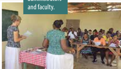
Presenting the new spiritual curriculum to HCH school administrators and faculty.