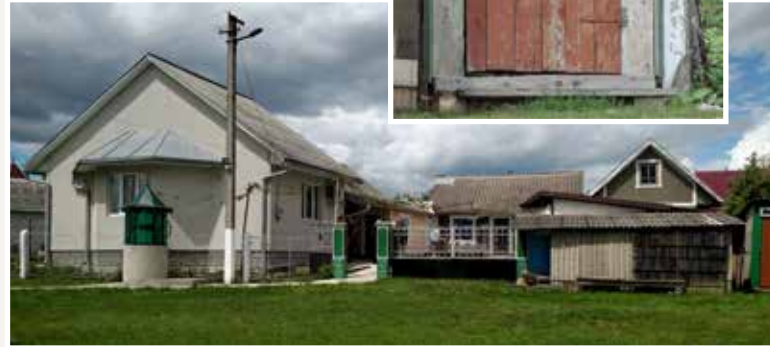
This outhouse is the only restroom facility for the 130 members and friends that gather in the current house-church at Magala, Ukraine.